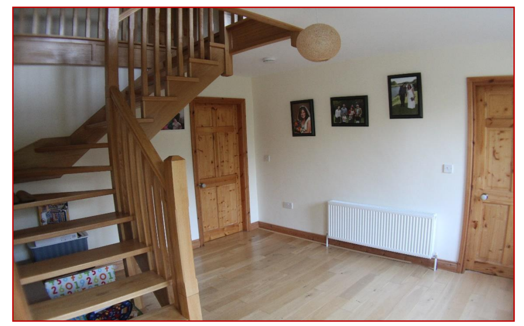
Entrance Hall - 4.1m x 3.4m