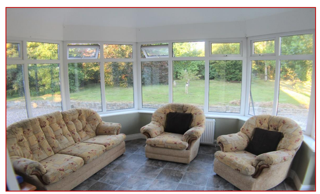
Conservatory - 3.8m x 3.3m