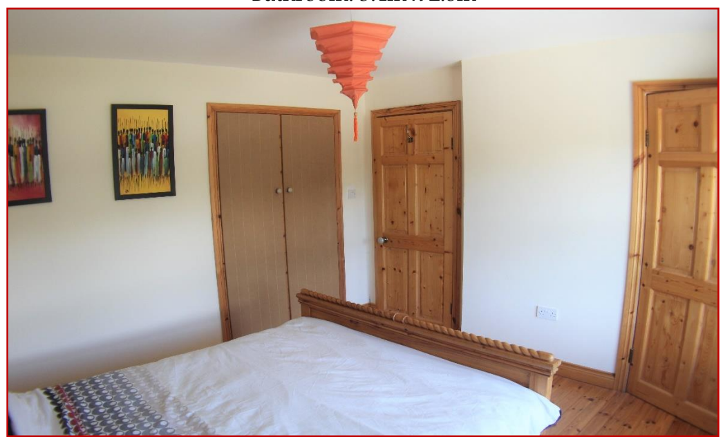
Master Bedroom - 3.6m x 3.4m with Ensuite