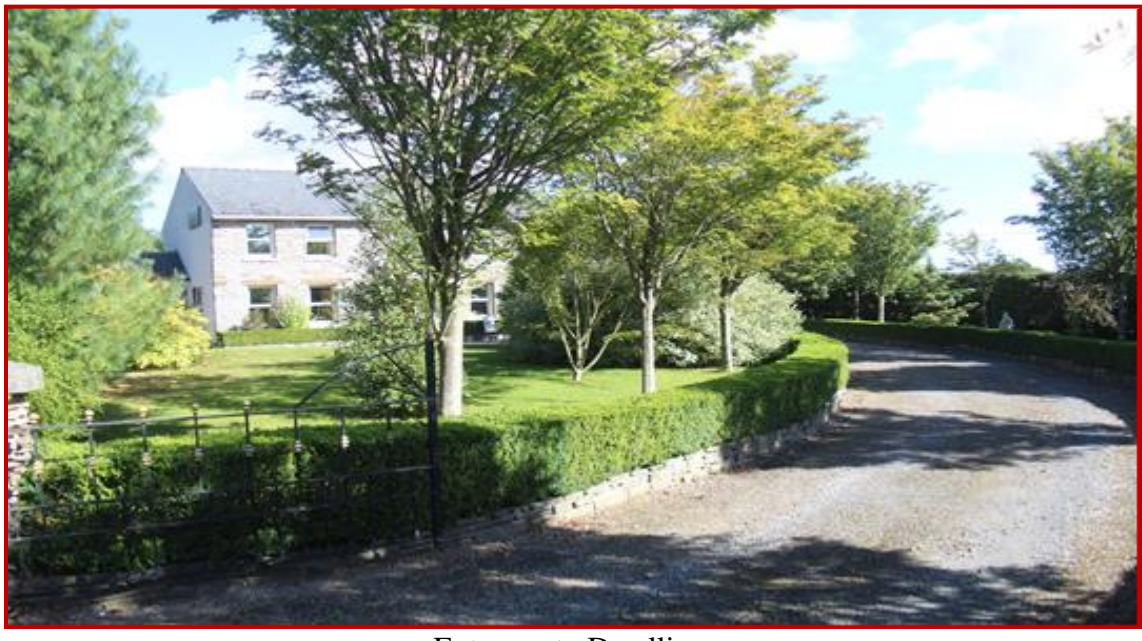
Entrance to Dwelling.