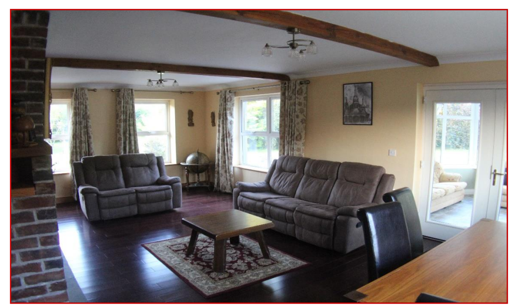
Sitting Room - 7.8m x 4.5m