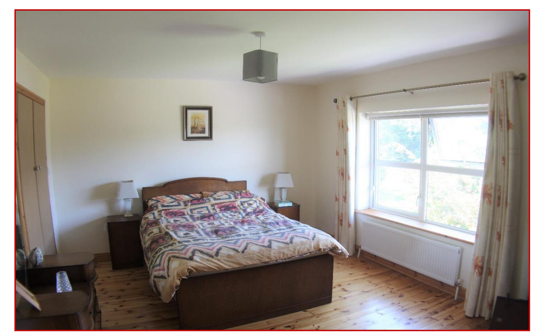
Bedroom 3 - 4.5m x 3.6m