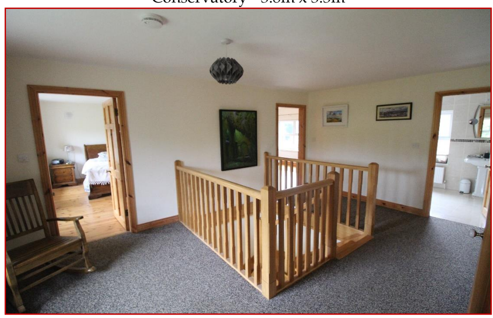
Upstairs Landing: 5.6m x 3.4m