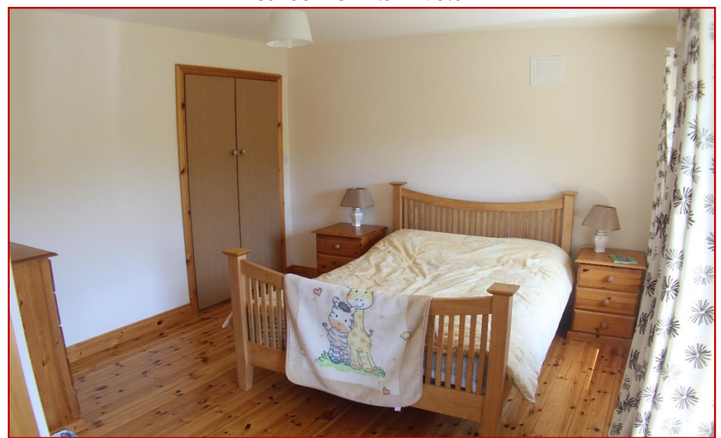
Bedroom 4 - 4.5m x 2.2m