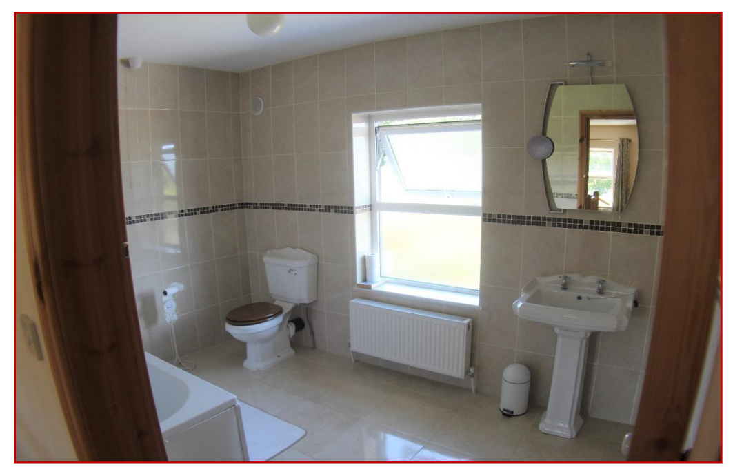
Bathroom: 3.4m x 2.8m