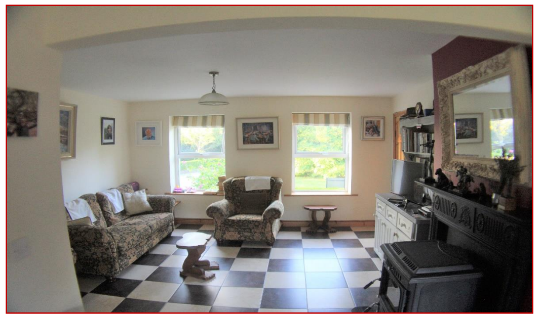
Living Room - 4.5m x 4.1m with Back Boiler Stove